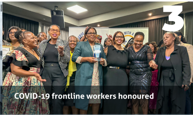
3 COVID-19 frontline workers honoured