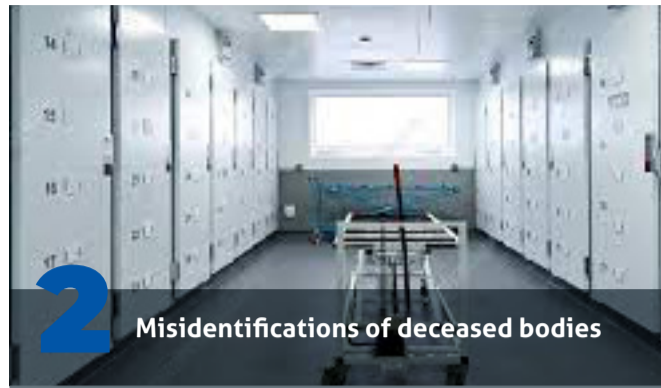
2 Misidentifications of deceased bodies